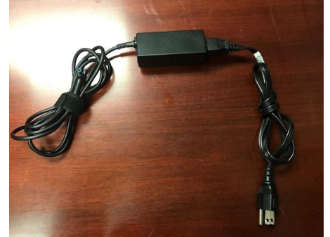
2 parts Adapter + Cable