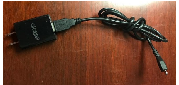
2 parts Plug + USB Cable

All of these items are the property of Kirbyville CISD and are required to be returned in good working order as per the guidelines outlined in the KCISD Student Handbook.